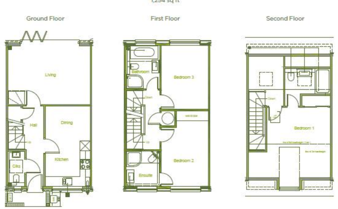
Plot 3 & 7 1,254 sq ft